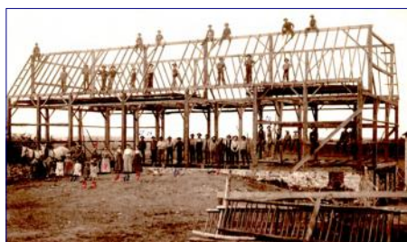
Building dairy barn 1904

When our ancestors came to America over 170 years ago, there were no food stores and few restaurants. Immigrants raised their own livestock and grew produce or purchased directly from farmers. Many of our ancestors in Germany and in Wisconsin had dairy cows which they milked by hand.