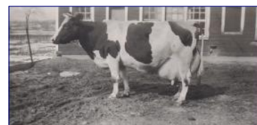
Seideman cow with large udder

Over the last 100 years, milk production per cow has increased sixfold. From selective breeding of cattle to new product development, the dairy industry led the way in