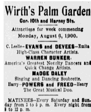
Omaha World Herald – 1900-08-08

By the 1890s, he was a "gentleman milliner." This was just the beginning of the many occupations that he worked at during his lifetime. He traveled all over the country and all over the world getting rave reviews wherever he went.