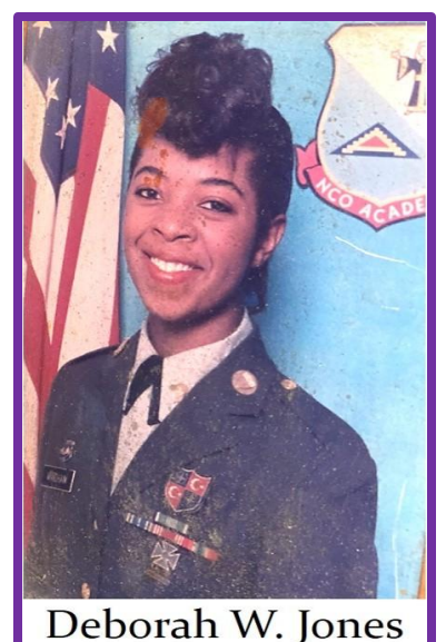
– SSG E6 Army Aug. 1984 – Aug 1998