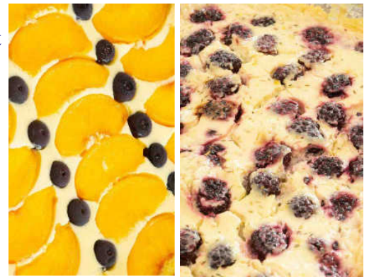
2018 First Prize winning Kuchens

Thanks to our Bakers, Bidders and Buyers!