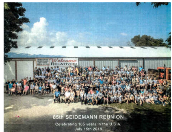
85 th SEIDEMANN REUNION Celebrating 165 years in the U.S.A. July 15th 2018

Please send order form and check to: Seidemann Family P. O. Box 184, Newburg, WI 53060-0184