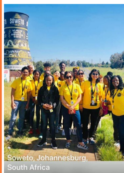
Soweto, Johannesburg, South Africa