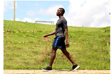
Article summarized from hhs.gov website

So family let's all take the first step. Get a little more active each day, and stay active and healthy.