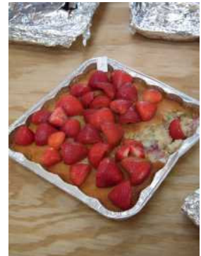
2012 First Prize winning Kuchens

Be Sure to Thank all the Volunteers that Make the Reunion a Success!