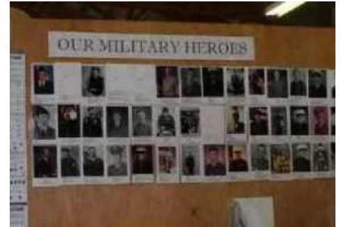
Family Members that have Served in the Armed Forces.

Please complete the form for each military person in your family. This should include your spouse, children, parents, grandparents or great grandparents, etc. if they served this country. Also submit a picture of yourself or them in military uniform. This information will be displayed on the "Military Hero Wall" at the Reunion. Send to: Seidemann Family P. O. Box 184 Newburg WI. 53060-0184 or email secretary@seidemannfamily.org .