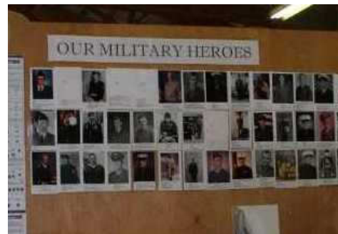
Family Members that have Served in the Armed Forces.

Name: _____ Branch: _____ Highest Rank: _____ Dates Served: _____ Unit Assigned To: _____ Engagements: _____ Recognitions Earned: _____