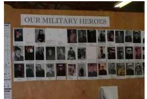
Family Members that have Served in the Armed Forces.

Please complete the form for each military person in your family. This should include your spouse, children, parents, grandparents or great grandparents, etc. if they served this country. Also submit a picture of yourself or them in military uniform. This information will be displayed on the "Military Hero Wall" at the Reunion. Send to: Seidemann Family P. O. Box 184 Newburg WI. 53060-0184 or email secretary@seidemannfamily.org .